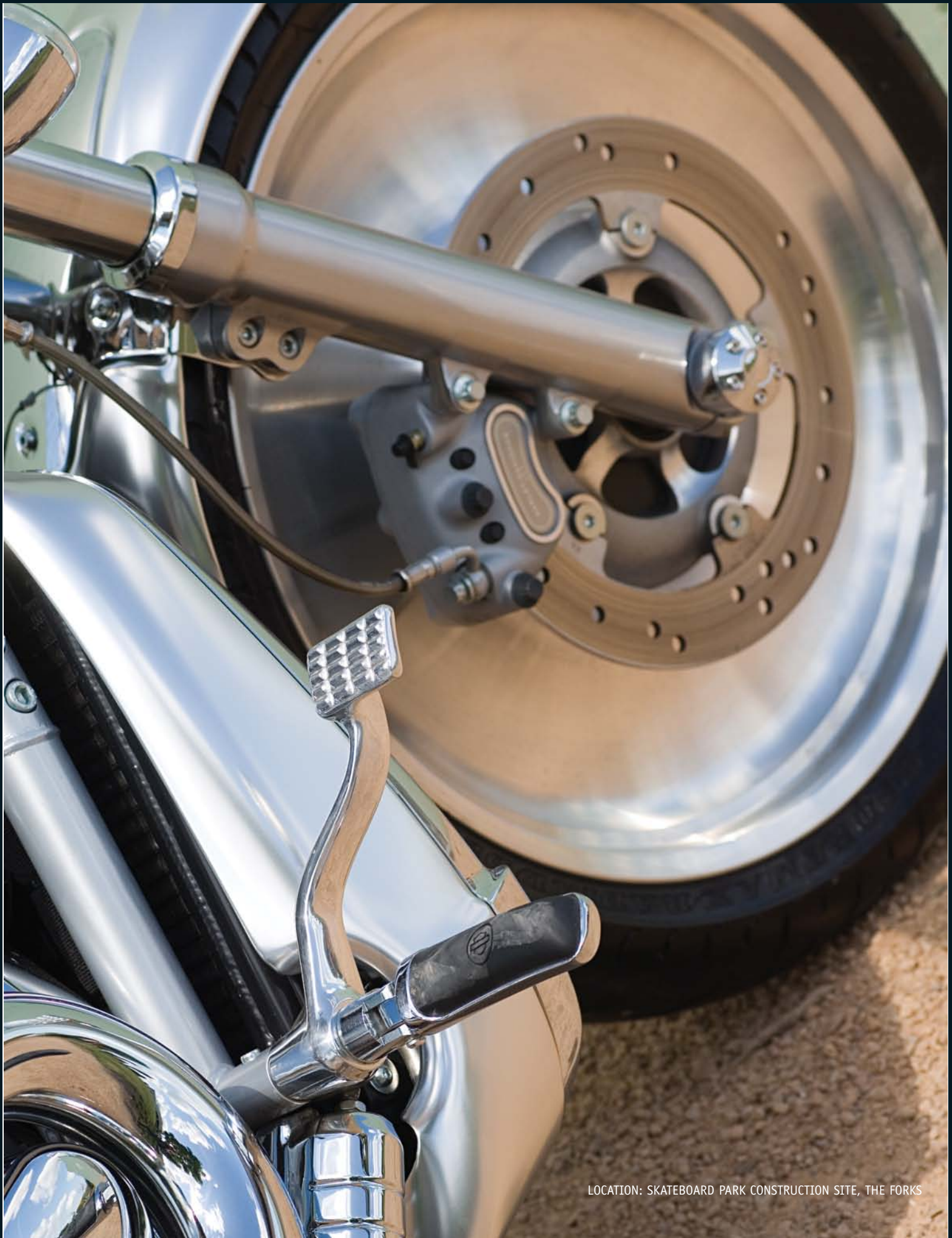
LOCATION: SKATEBOARD PARK CONSTRUCTION SITE, THE FORKS